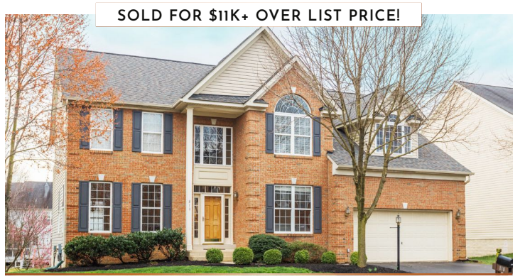
818 SADDLEBACK PLACE NE Sold for $706,000