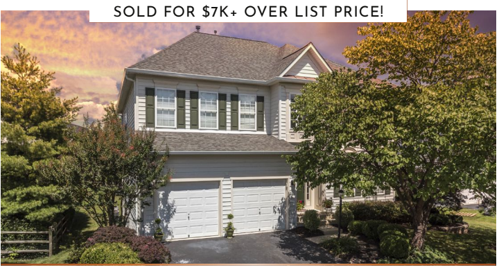
43016 BATTERY POINT PLACE Sold for $756,000