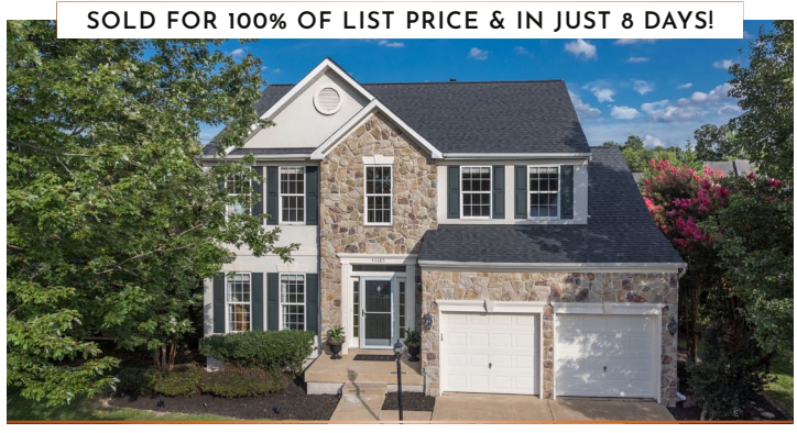
43185 CARDSTON PLACE Sold for $638,000