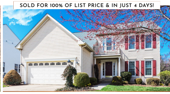
43196 CARDSTON PLACE Sold for $659,000