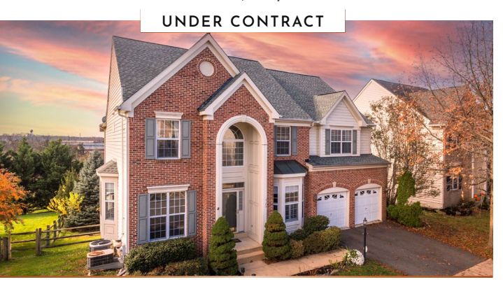
729 VERMILLION DRIVE Listed for $729,000