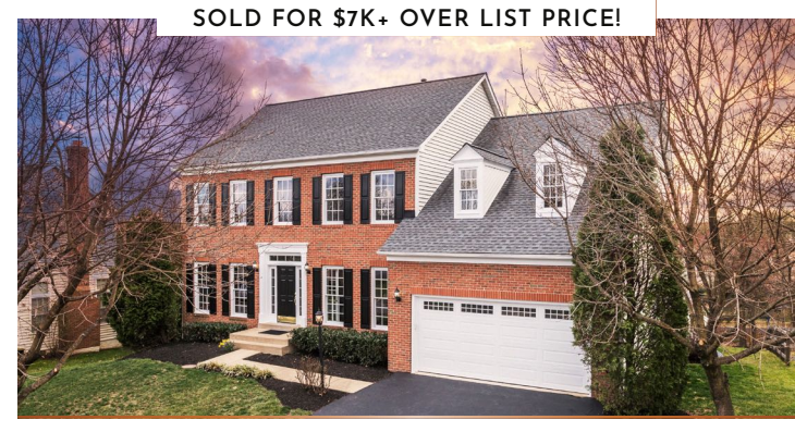
18563 DETTINGTON COURT Sold for $672,000