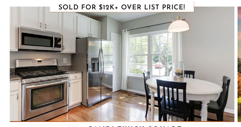
43102 CANDLEWICK SQUARE Sold for $387,000