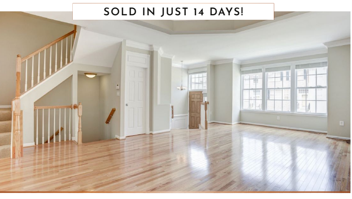
43071 SHADOW TERRACE Sold for $475,000