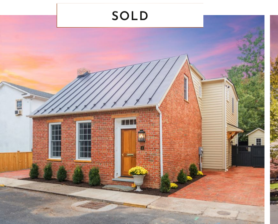
16 LIBERTY STREET 3 Beds · 3 Baths · 2,200 Sq. Ft. Listed for $850,000