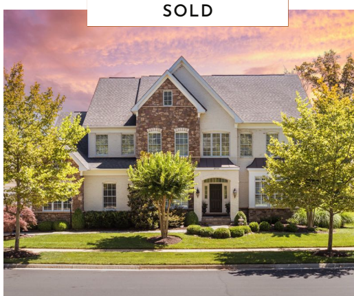
18772 RIDGEBACK COURT 6 Beds · 5.2 Baths · 7,002 Sq. Ft. Sold for $1,335,000