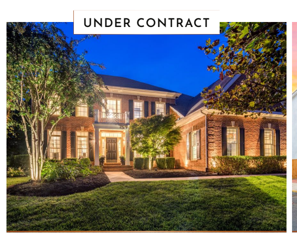
18761 UPPER MEADOW DRIVE 4 Beds · 4.1 Baths · 6,266 Sq. Ft. Listed for $1,165,000