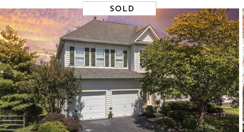
43016 BATTERY POINT PLACE 6 Beds · 4.1 Baths · 4,266 Sq. Ft. Sold for $756,000

It would be my honor to feature your home and get incredible results. Contact me at 703.599.1178 to discuss.