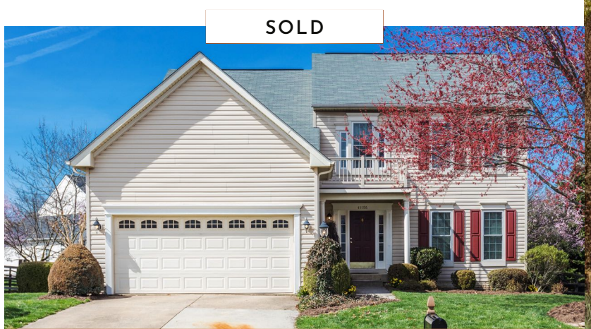
43196 CARDSTON PLACE 5 Beds · 2.1 Baths · 3,520 Sq. Ft. Sold for $659,000