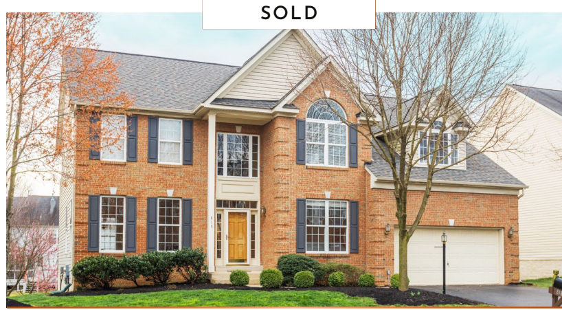
818 SADDLEBACK PLACE NE 6 Beds · 3.1 Baths · 4,182 Sq. Ft. Sold for $706,000