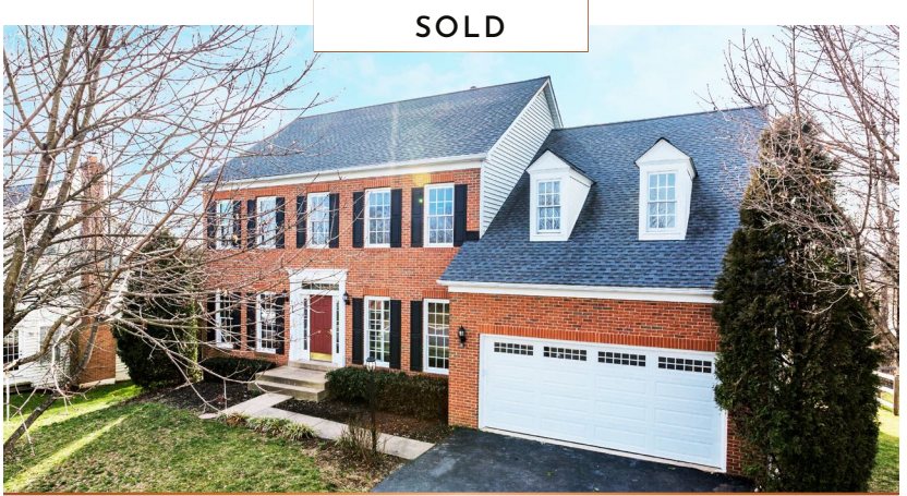
18563 DETTINGTON COURT 4 Beds · 2.1 Baths · 3,104 Sq. Ft. Sold for $672,000