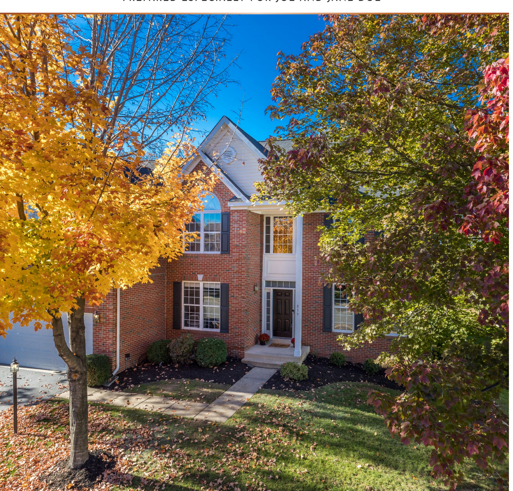
819 SADDLEBACK PLACE NE 4 Beds · 3.1 Baths · 4,545 Sq. Ft. Sold for $898,000