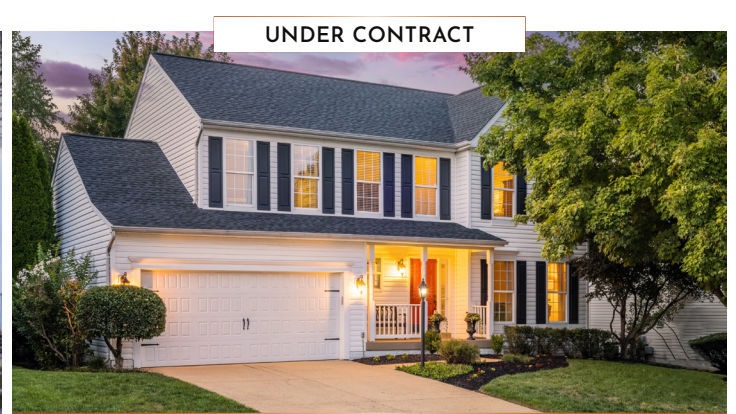
43216 CARDSTON PLACE Listed for $794,900