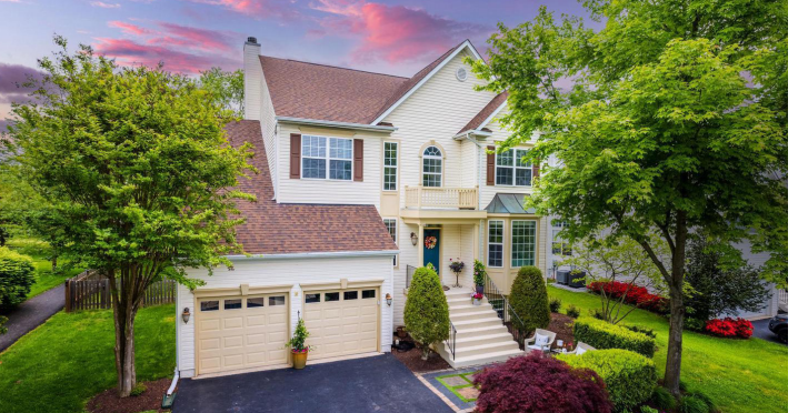
1512 BARKSDALE DRIVE NE Sold for $830,000