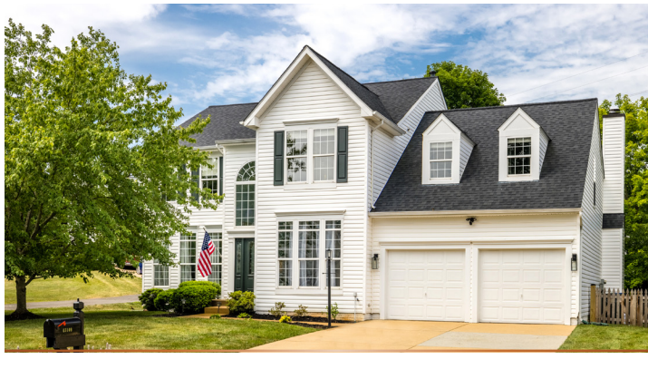
43109 BINKLEY CIRLE Sold for $800,000