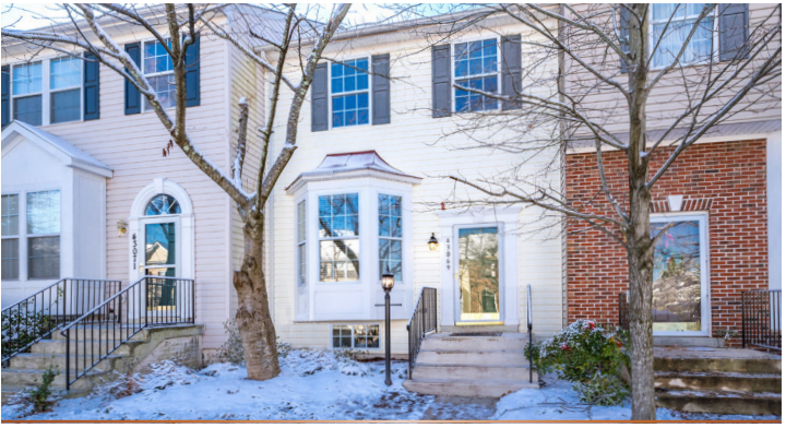
43069 CANDLEWICK SQUARE Sold for $500,000