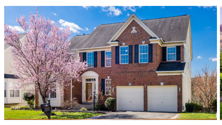
741 BONNIE RIDGE DRIVE NE Sold for $900,000